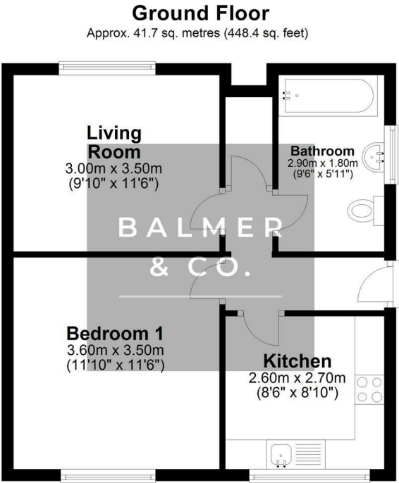
Total area: approx. 41.7 sq. metres (448.4 sq. feet)

BALMER & CO in LEIGH are delighted to offer for sale this one bedroom, ground floor apartment in Leigh. Offered with no onward chain this property comprises in brief of entrance hallway, large living room, modern fitted kitchen/dining room, master bedroom, with three piece bathroom completing the accommodation on offer. Outside the property is offers allocated parking, with communal garden to both the front and rear. Early viewings highly recommended, all enquiries welcome.